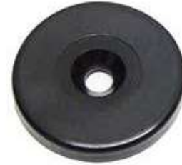
Check Point Tags