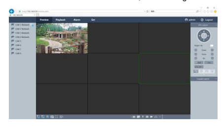
Figure 2-8 WEB

time to login, it will notice you to install the plug-in; you can install it from download from web site, shown as figure 2-8.