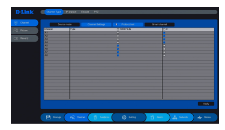
Figure 2-3 Change Channel type