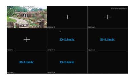
Figure 2-5 live view interface