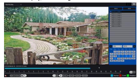
Figure 2-6 Playback

The HD DVR support 6 types' playback modes shown as picture 2-15, you can select one type and click playback icon to start play, shown as figure 2-6.